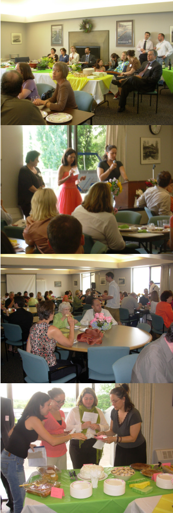
FIS Graduation Gala, June 2007.

The Division of French and Italian Studies wishes to thank the following local businesses for their generous gift donations for this year's Graduation Gala: