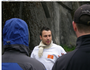
French 103 instructors & students at Woodland Park Zoo